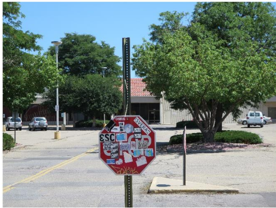
Blight Factor (e): Deterioration of Site or Other Improvements: Deteriorated signage