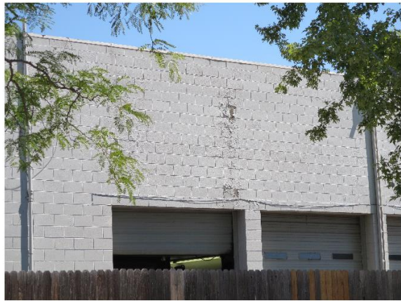
Blight Factor (a): Slum/Deteriorated Structures: Paint/siding deterioration